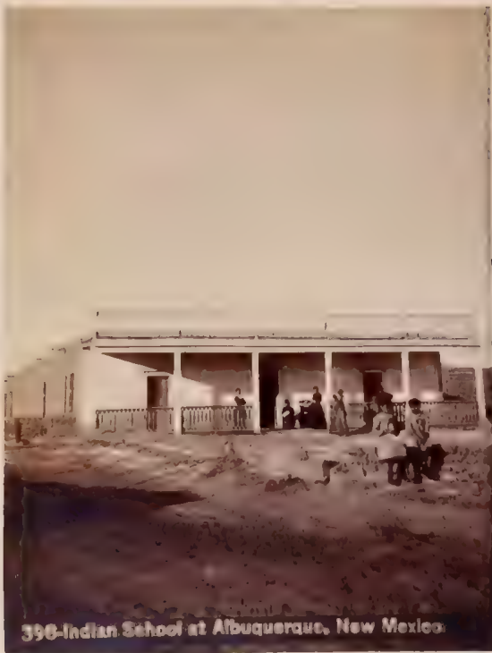
396-Indian School at Albuquerque, New Mexico.